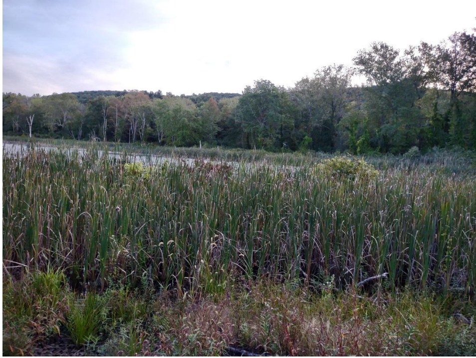
Area of Phragmites