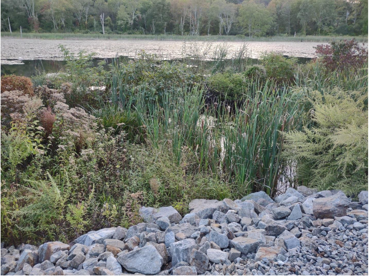
Railroad embankment near rail trail